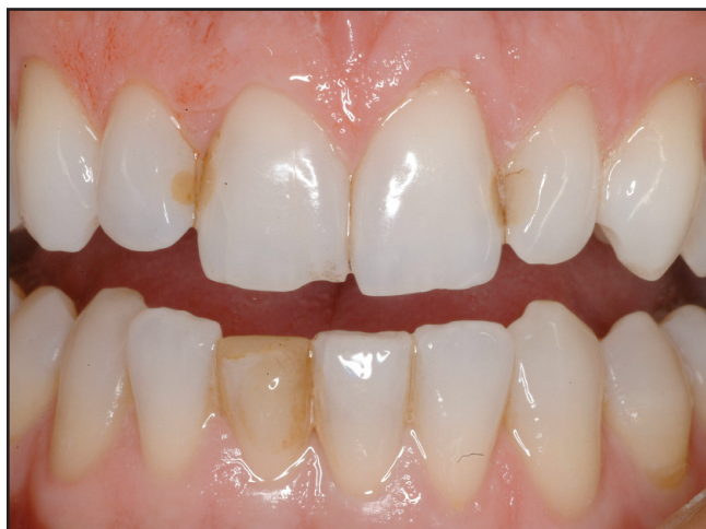
Figure 1. Preoperative view of stained and discolored teeth in the maxilla and mandible.

Porcelain laminate veneers, by nature a conservative modality that provides excellent potential for aesthetic enhancement when their indications are respected,