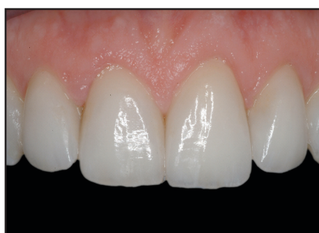
Figure 6. Close up view of the final restorations for the upper maxillary teeth.