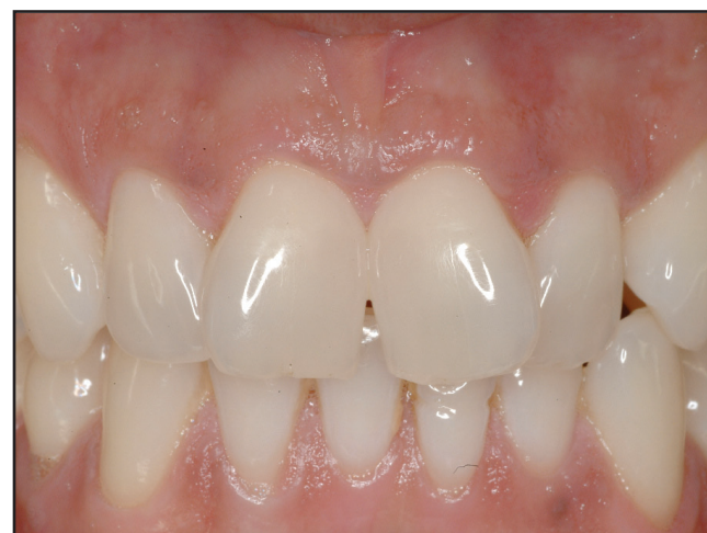
Figure 8. Retracted preoperative view of the misaligned teeth #7(12) through #10(22).

The initial diagnostic evaluation consisted of thorough extra- and intraoral examinations, temporomandibular joint and muscle evaluation, a series of digital photographs, and the mounting of study casts in centric relation. Clinical examination revealed a relatively healthy dentition with adequate oral hygiene. While there was minimal occlusal wear on the posterior teeth, chipping and discolored composite restorations on teeth #7(12) through #10(22) and #25(41) was evident. No joint or muscle tenderness was noted. Upon consultation with the patient, it was decided to take a minimally invasive