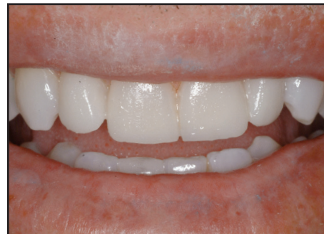
Figure 4. One of the final steps taken is to do a smile evaluation of provisionals.

can be effective in this regard. Preservation of sound tooth structure must remain a goal throughout tooth preparation. 3 Ideally, this philosophy also entails the clinician's preparation of as few teeth as possible to obtain the desired aesthetics. For example, where the placement of four veneers (potentially with an adjunctive procedure such as tooth whitening) instead of eight or ten could accomplish aesthetic enhancement, the less invasive procedure should be undertaken. Though shade matching can be challenging when one or two teeth are being