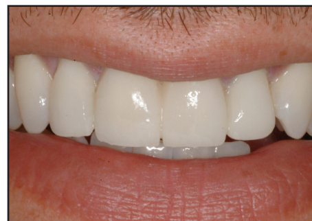
Figure 12. View of the provisional restorations used to confirm aesthetic improvement of the patient's smile.