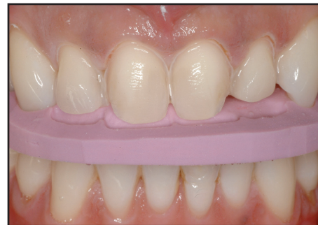
Figure 10. The teeth were prepared using a laboratory preparation model and an incisal guide index.