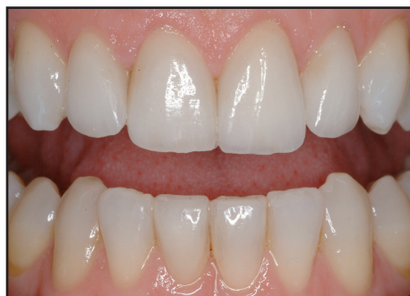
Figure 5. Retracted view of the final restorations for the maxillary and mandibular anterior teeth.