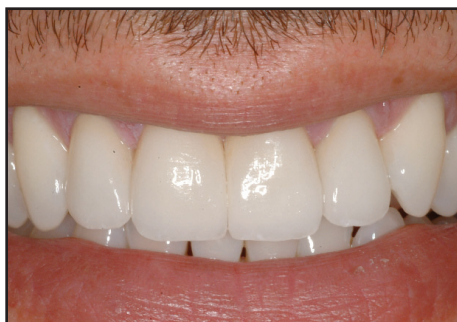
Figure 16. View of the patient's smile demonstrating improved aesthetics.