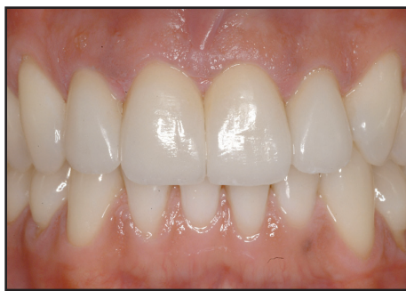
Figure 13. Retracted view of the final restorations.