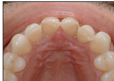
Figure 11. Occlusal view of the prepared maxillary incisors.