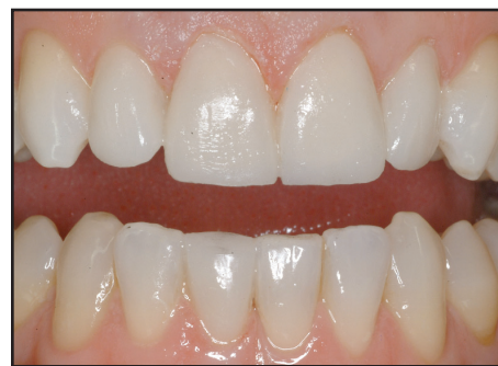
Figure 3. A retractive view of the maxillary and mandibular anterior provisionals.