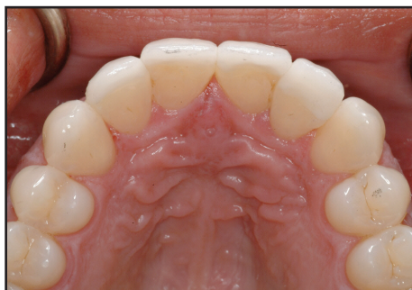
Figure 15. Occlusal view of the final restorations on the maxillary incisors.