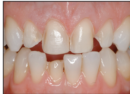
Figure 2. The teeth were prepared by removing the old composite restorations, followed by placement of the interproximal elbow.