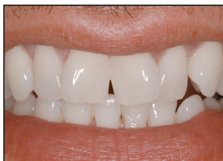
Figure 7. Preoperative view of the patient's smile reveals misaligned teeth in the anterior maxilla.

treated, veneering the anterior four incisors allows for a more predictable shade match and improved color transition to the posterior teeth. This minimally invasive philosophy should also allow for a more pleasant experience for the patient, while retaining more natural tooth structure.