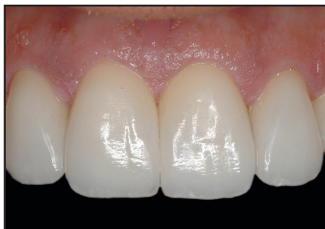
Figure 14. Close-up view of final restorations of teeth #7(12) through #10(22).