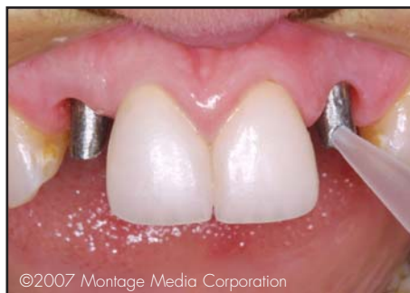
Figure 6. Facial view depicts injection of the provisional material around the prepared provisional abutments.