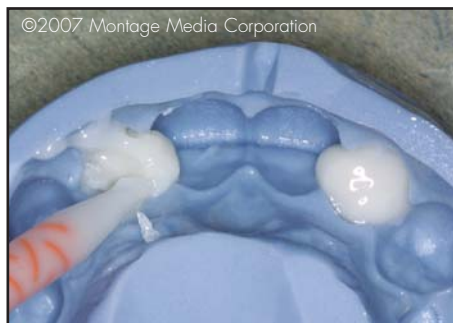
Figure 8. Injection of the provisional material into the putty matrix fabricated from the diagnostic waxup.

the removable provisional prosthesis was created from the diagnostic waxup. Following six weeks of initial primary tissue healing of the surgical site, teeth #8 and #9 were treated with minor laser gingival recontouring to establish soft tissue contour and zenith placement, and the all-ceramic crowns were placed. With the definitive restorations in place, a significant aesthetic improvement was achieved during the remaining five-month healing period and allowed the patient to preview the projected aesthetic outcome. After osseointegration and