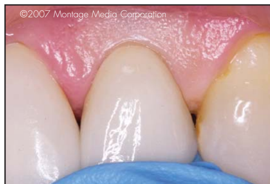
Figure 14. The custom implant abutments and restorations were tried in to ensure accurate fit and aesthetics.