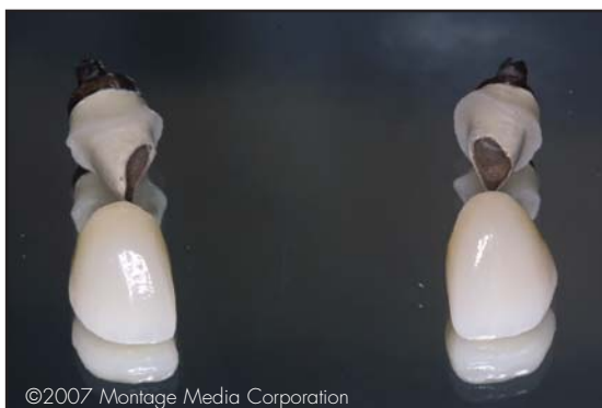
Figure 13. Upon receipt from the laboratory, the definitive abutments and crowns were inspected for accuracy.