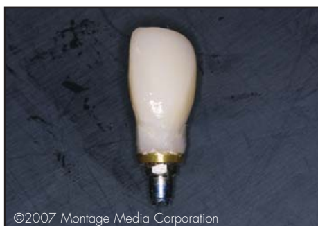
Figure 11. Material was added to the neck of the abutment, which was adjusted until the desired contours were achieved.

second-stage surgery was completed, the patient presented for the final implant-supported restoration of teeth #7 and #10.