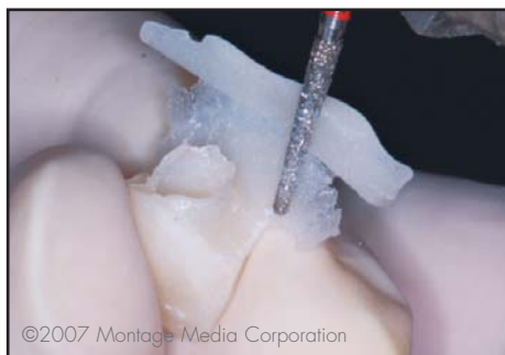
Figure 10. Light-cured composite was used to contour the provisional restoration.