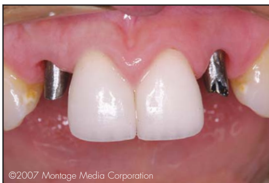
Figure 5. The provisional abutments were prepared to reflect the preparation design required for full coverage of the lateral incisors.

Since implant stability was not achieved at the time of surgery, the removable provisional restoration was adjusted and inserted so as to not traumatize the surgical site. A traditional six-month healing period allowed for osseointegration of the implants. 17-19 Based on the expected definitive restorations' proportions and color,