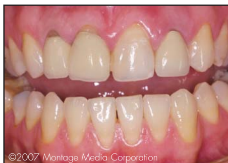
Figure 1. Retracted view of the patient's dentition revealed multiple failing restorations throughout the maxillary and mandibular arches.

Immediate implant placement has been advocated to preserve alveolar height and width since 1989, 7-10 and is recommended for its ability to reduce tissue loss following tooth extraction. 11-13 Utilization of a customized provisional abutment and immediate provisionalization allows for the maintenance of gingival and alveolar structures. They provide optimal aesthetics during the healing phase and the benefit of eliminating the use of a removable prosthesis provisional. The fixed, customized provisional