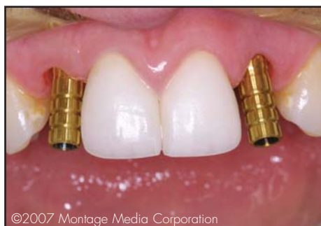
Figure 4. The healing caps were removed, and provisional abutments were placed in site #7 and #10.

restoration on the day of implant surgery. The provisional can be placed at the surgical appointment or the patient can return for it within 24 to 72 hours after surgery. The patient benefits from the immediate aesthetic result that eliminates the need for other forms of removable provisionalization. There are two types of provisionals: 1) laboratory fabricated—whether computer guided or traditionally fabricated with stone and lab components—or 2) custom-fabricated by the clinician. Although a laboratory-fabricated provisional is a viable treatment modality, a provisional restoration customized chairside provides added flexibility in tissue guidance and eliminates additional laboratory expenses. Prefabricated laboratory provisionals, although well planned, may not address the tissue requirements presented chairside. Working with stone models in the laboratory environment, although a good simulation, may not be as accurate as what can be fabricated chairside due to tissue changes encountered as a result of surgery not captured in the pre-treatment stone model.