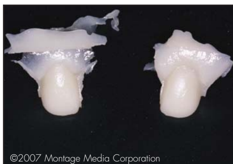
Figure 9. The provisional abutments and restorations were removed from the matrix to facilitate contouring and finishing.