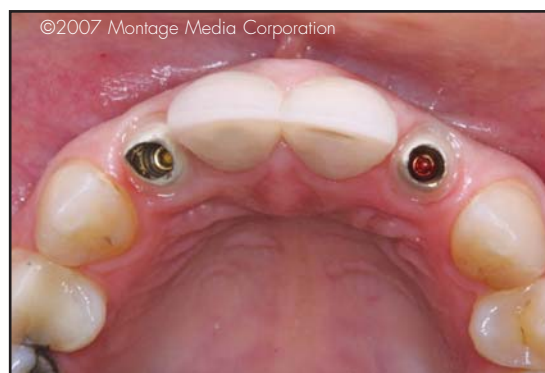
Figure 16. Occlusal view of the final custom abutments seated in proper position for ideal aesthetics and function.

The provisional abutment and restoration were subsequently tried in, and any final adjustments were made for tissue support and emergence profile. The provisional abutment screw was placed and tightened to the proper torque, the provisional restorations were cemented, and the occlusion was adjusted (Figure 12).