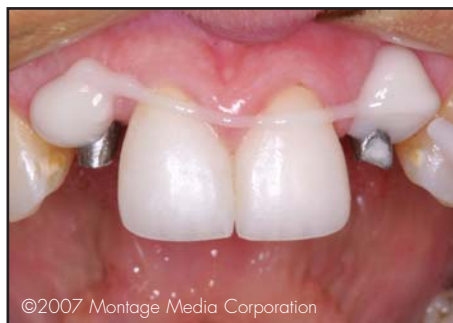
Figure 7. The provisional abutments were covered with a provisional acrylic material, prior to insertion of the putty matrix.