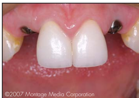
Figure 3. The patient presented with the second-stage healing caps in place approximately six months following implant placement.