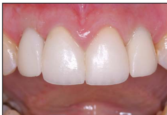
Figure 12. The provisional restorations were cemented in place, and any required occlusal adjustments were made.

The provisional restoration was contoured with light-cured composite, which was placed around the abutment side of the provisional restorations (Figure 10). This process was repeated as each was contoured to create the proper emergence profile. Composite material was similarly added to the neck of each provisional abutment and contoured until the desired contours had been achieved for the provisional abutment and restorations (Figure 11).