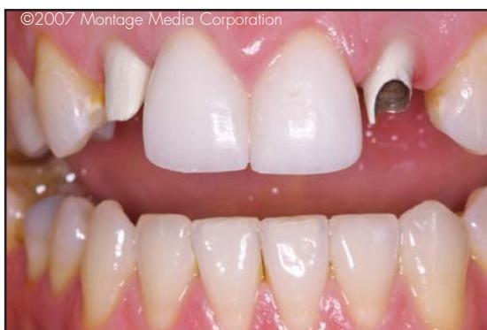
Figure 15. Following successful try-in, a polyvinyl block-out material was placed in the screw access opening.