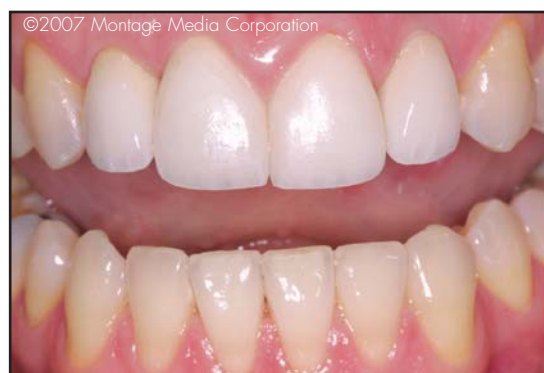
Figure 18. Postoperative view of the definitive implant restorations, all-ceramic crowns, and tooth-whitened anterior dentition.

The utilization of a custom-fabricated provisional abutment and restoration following a six-month period of implant healing can aid in the preservation of hard and soft tissues. In this case, the fabrication of an immediate, customized